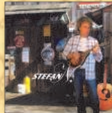
„At Blacksmith Shop“