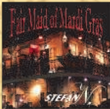
„Fair Maid of Mardi Gras“