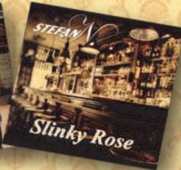
„Slinky Rose“ *)